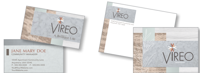
BUSINESS CARD 3.5" x 2"