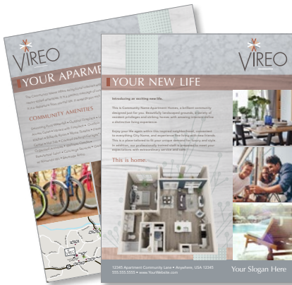
FLYER 8.5" x 11"