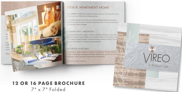
12 OR 16 PAGE BROCHURE 7" x 7" Folded