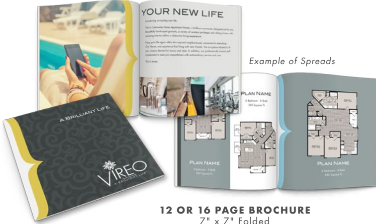
12 OR 16 PAGE BROCHURE 7" x 7" Folded