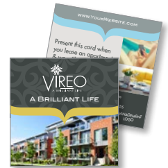
PROMO CARD 4" x 4"