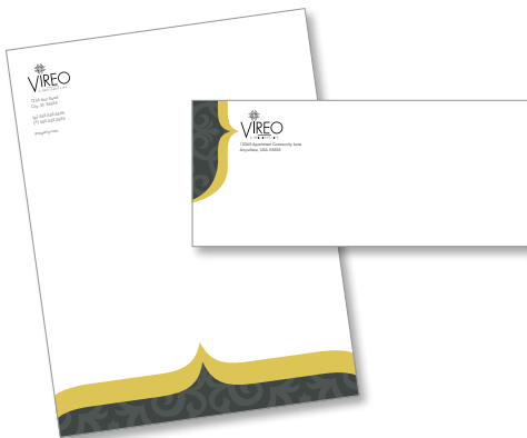
LETTERHEAD W/ ENVELOPE 8.5" x 11"; #10 Standard