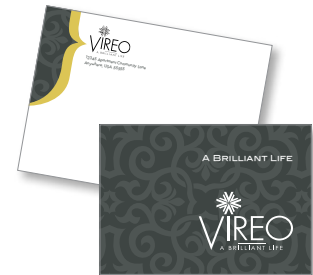
THANK YOU CARD W/ ENVELOPE 6" x 4.25" Folded; A6