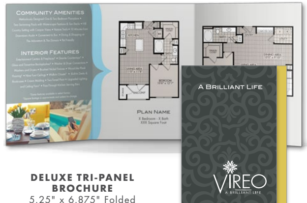
DELUXE TRI-PANEL BROCHURE 5.25" x 6.875" Folded