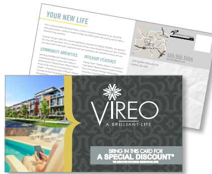
POSTCARD 11" x 6"