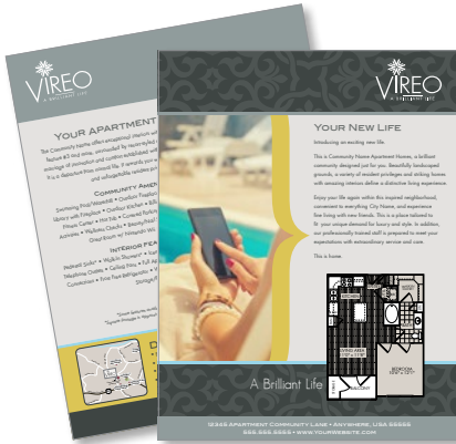
FLYER 8.5" x 11"