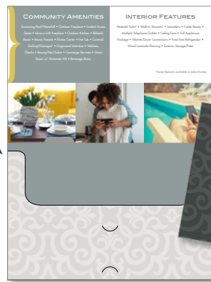
COMPACT POCKET BROCHURE 9" x 6"