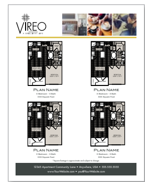
FLOOR PLAN INSERT 8.5" x 11"