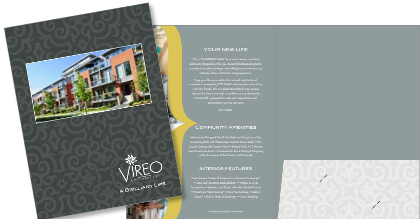
POCKET FOLDER 9" x 12"