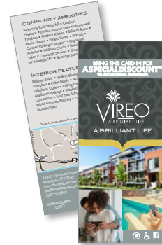
RACK CARD 4" x 9"