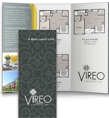
STANDARD TRI-PANEL BROCHURE 3.75" x 8.5" Folded