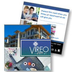
PROMO CARD 4" x 4"