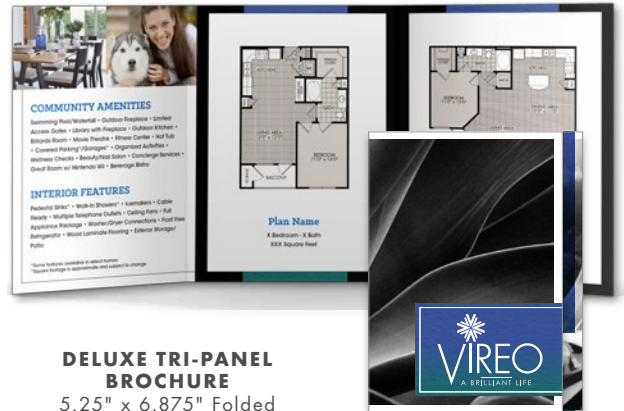
DELUXE TRI-PANEL BROCHURE 5.25" x 6.875" Folded