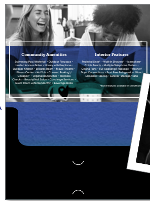
COMPACT POCKET BROCHURE 9" x 6"