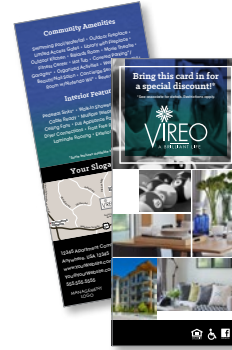
RACK CARD 4" x 9"