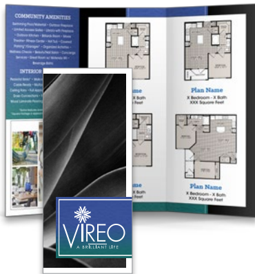
STANDARD TRI-PANEL BROCHURE 3.75" x 8.5" Folded