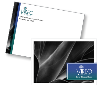
THANK YOU CARD W/ ENVELOPE 6" x 4.25" Folded; A6