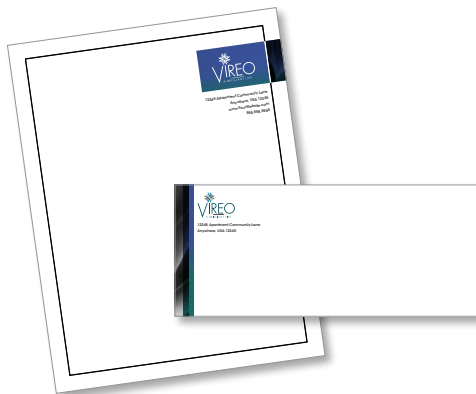
LETTERHEAD W/ ENVELOPE 8.5" x 11"; #10 Standard