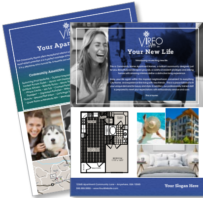
FLYER 8.5" x 11"