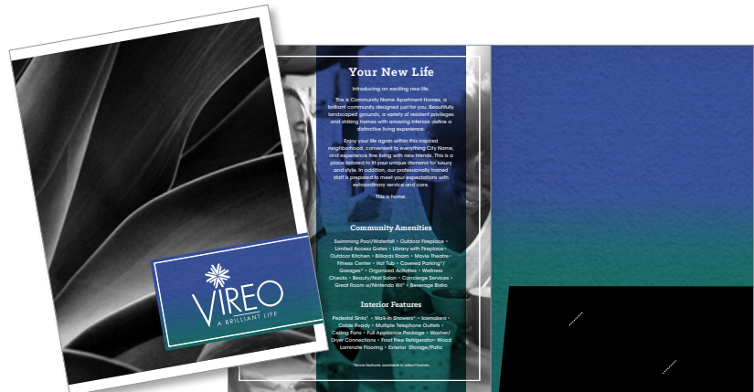
POCKET FOLDER 9" x 12"