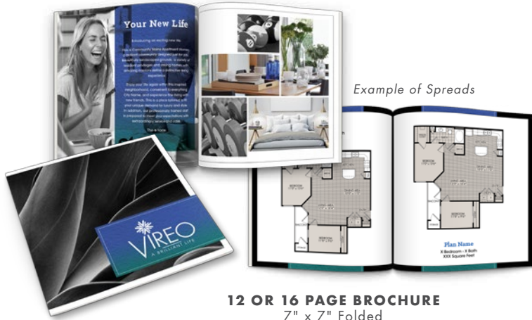
12 OR 16 PAGE BROCHURE 7" x 7" Folded