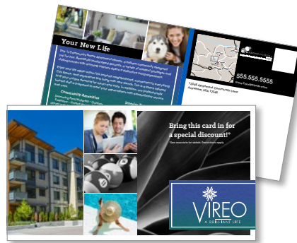
POSTCARD 11" x 6"