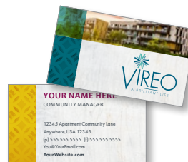
BUSINESS CARD 3.5" x 2"