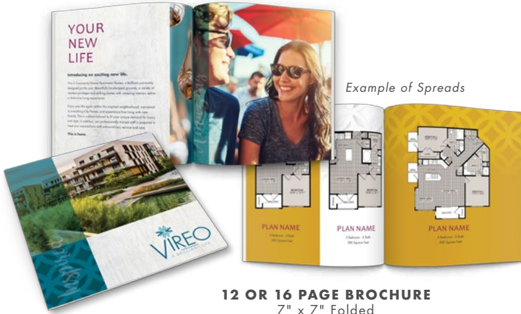
12 OR 16 PAGE BROCHURE 7" x 7" Folded