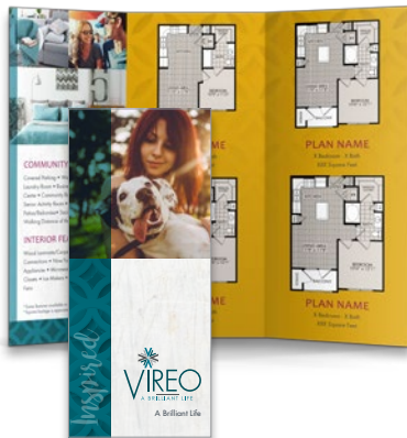
STANDARD TRI-PANEL BROCHURE 3.75" x 8.5" Folded