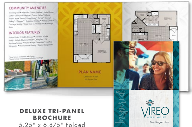
DELUXE TRI-PANEL BROCHURE 5.25" x 6.875" Folded