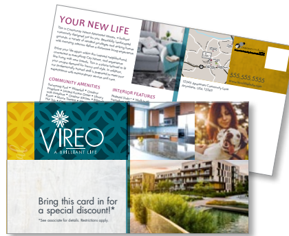
POSTCARD 11" x 6"