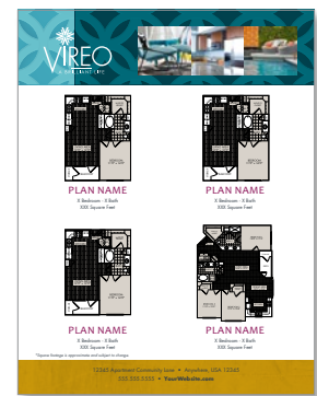
FLOOR PLAN INSERT 8.5" x 11"