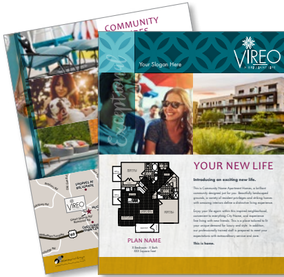
FLYER 8.5" x 11"