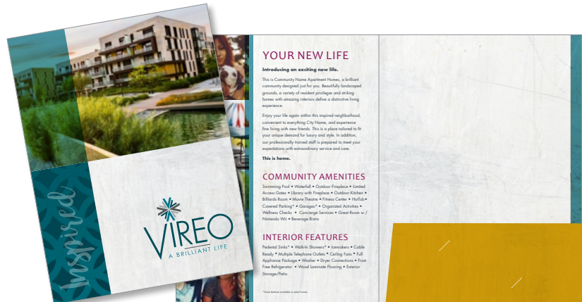
POCKET FOLDER 9" x 12"