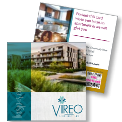
PROMO CARD 4" x 4"