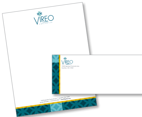
LETTERHEAD W/ ENVELOPE 8.5" x 11"; #10 Standard