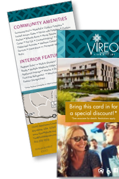
RACK CARD 4" x 9"