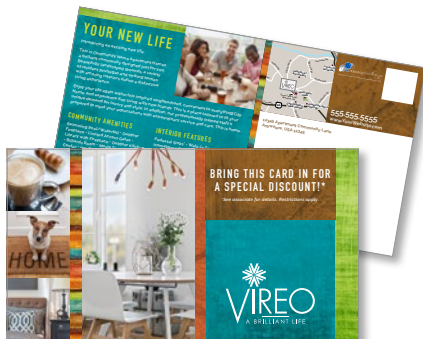
POSTCARD 11" x 6"