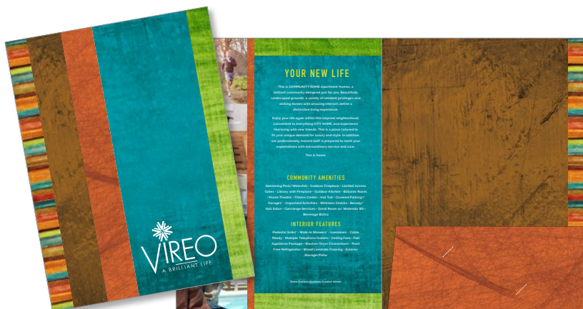
POCKET FOLDER 9" x 12"