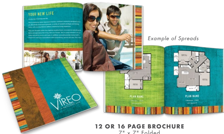
12 OR 16 PAGE BROCHURE 7" x 7" Folded