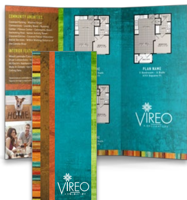
STANDARD TRI-PANEL BROCHURE 3.75" x 8.5" Folded