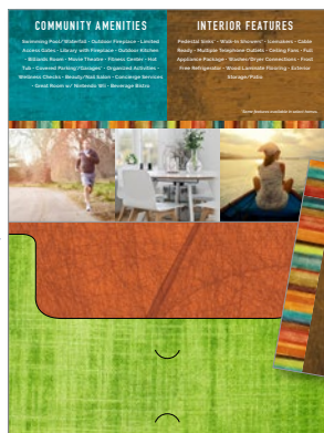
COMPACT POCKET BROCHURE 9" x 6"