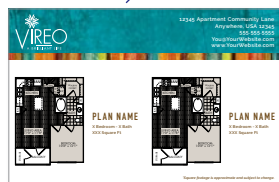
COMPACT FLOOR PLAN INSERT 8.5" x 5.5"