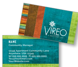
BUSINESS CARD 3.5" x 2"