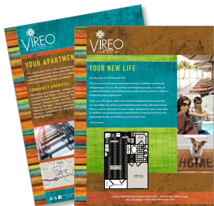
FLYER 8.5" x 11"