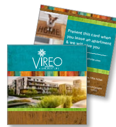
PROMO CARD 4" x 4"