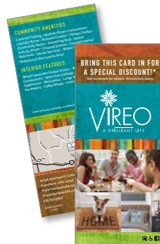
RACK CARD 4" x 9"