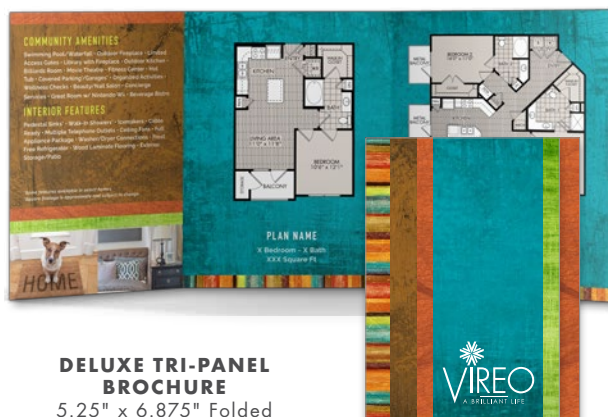
DELUXE TRI-PANEL BROCHURE 5.25" x 6.875" Folded