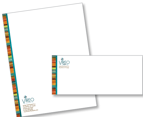
LETTERHEAD W/ ENVELOPE 8.5" x 11"; #10 Standard